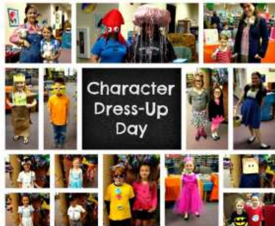
Character Dress-Up Day