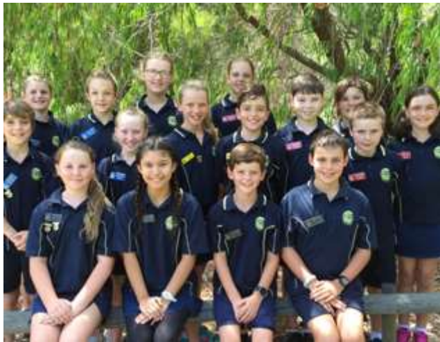
2017 CPPS TERM 1 STUDENT LEADERS