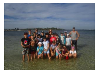
POINT WALTER TREK