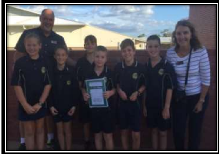
CPPS 3 rd Place Year 4/5 students entered a year 5/6 maths competition